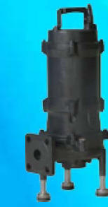
UMGN1500/SEG/1 UMGN1500/SEG/3 UMGN2200/SEG/3