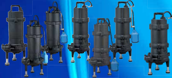
UM/UAGN1000/32/1 UM/UAGN1000/32/3 UAGN1000/32/1-FSLC