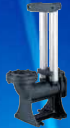
GUIDE RAIL SYSTEM