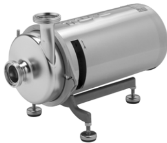
Fig. 1 Euro-HYGIA®