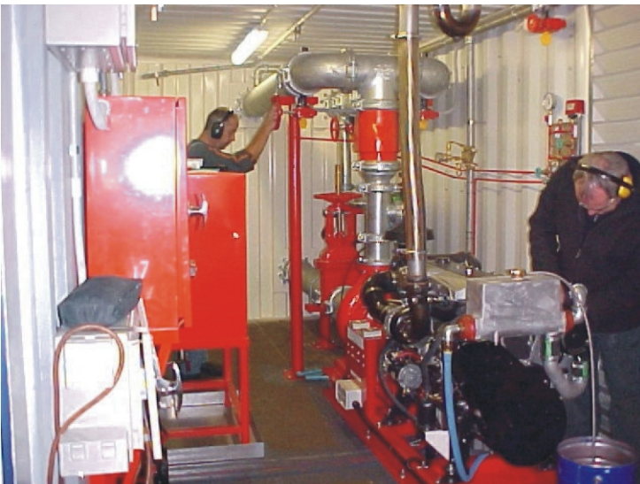
Australian engineered and manufactured packages to meet international standards.

KSB Ajax Fire Pumps are manufactured in Australia, and are available with compliance to the following local & international standards: