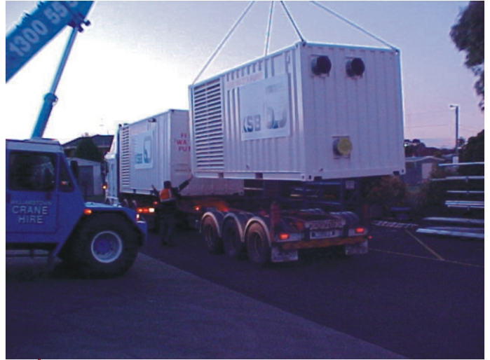
Containerised Turnkey Fire Pumps, with fast turn-around times delivered direct to site.

With a complete range of pumps, accessories and auxiliary equipment, our fire pump engineering team can design a package that meets the requirements for most commercial, industrial, oil & gas, power or mining projects.