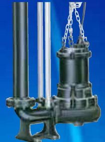
GUIDE RAIL SYSTEM