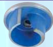
Single channel, semi-open impeller with tungsten cutting tip