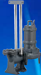
GUIDE RAIL SYSTEM