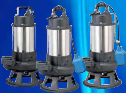
UM/UACN750/50/1 UM/UACN750/50/3 UACN750/50/1 - FSLC