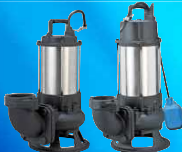
UM/UACN1500/80/1 UM/UACN1500/80/3 UM/UACN2200/80/3